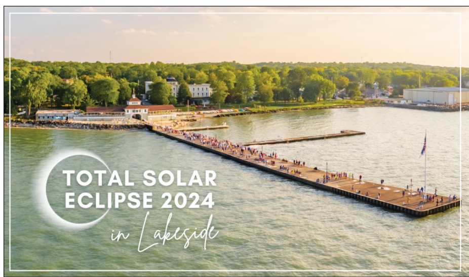
Lakeside is planning a weekend full of activities to celebrate the Total Solar Eclipse.

Shuttles will NOT be offered during the Total Solar Eclipse weekend, so plan to walk