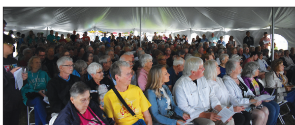
Historic Camp Meeting

• Historic Camp Meeting | Tuesday, July 23 | 7:30 p.m. | Hotel Lakeside Lawn — Lakeside began as a Camp Meeting, an idea of gathering in a retreat-like setting and growing in faith together.