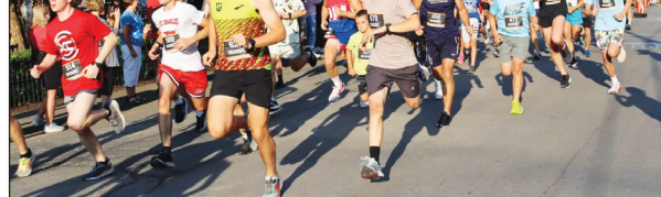
5K Raccoon Run & One-Mile Fun Run

• All-Lakeside Pickleball Tournament | Wednesday-Friday, July 17-19 | Hubbard Pickleball Center — Players of all skill levels are invited. The tournament features a variety of youth and adult divisions, as well as singles and doubles divisions.