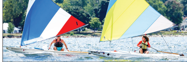
Lakeside Sailing Regatta

• All-Lakeside Tennis Tournament | Monday-Friday, July 22-26 | Williams Tennis Campus — Join other tennis enthusiasts for an action-packed week of doubles and singles events. Maximum of 3 divisions per player.