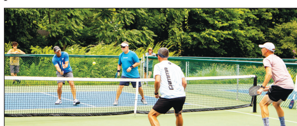
All-Lakeside Pickleball Tournament

• National Shuffleboard Tournaments | Monday-Friday, July 15-19 | Bettinger Park — Lakeside is hosting national singles and doubles shuffleboard tournaments for ages 15+ all week. There is no entry fee for any of the events and all equipment is provided. Visit lakesideohio.com/calendar for other tournaments this season.